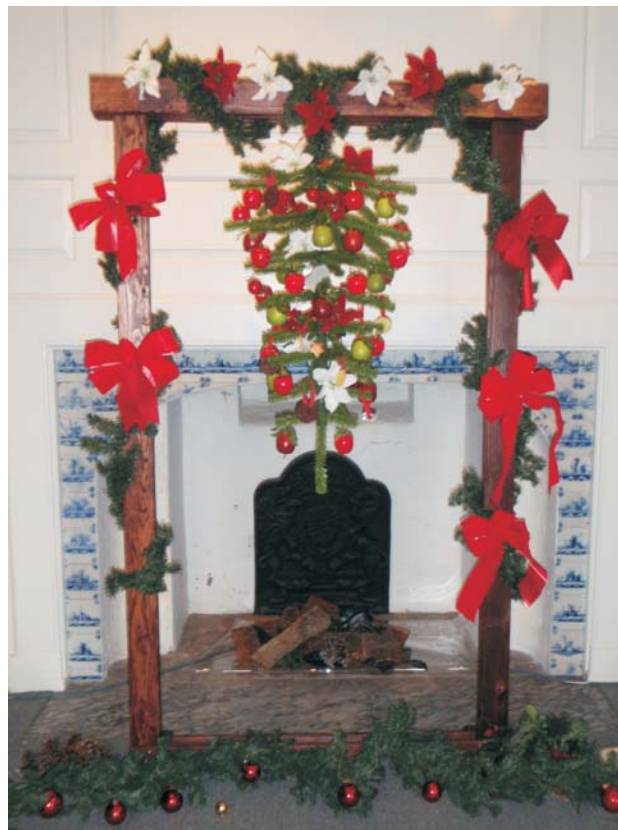
An upside-down Christmas Tree on display at Holidays at Hope Lodge. Story and more pictures on page 7.