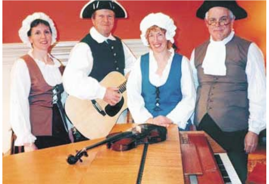
D-Major Singers, who will perform at Ballads in the Mill, April 20.

Reservations and prepayment required. Seating is limited. Parking at Hope Lodge. House tour at 4:30pm-5:30pm. Party 5:30pm-8pm (Reduced fee for Friends Members). Call 215-646-1595 during regular operating days/hours for additional information.