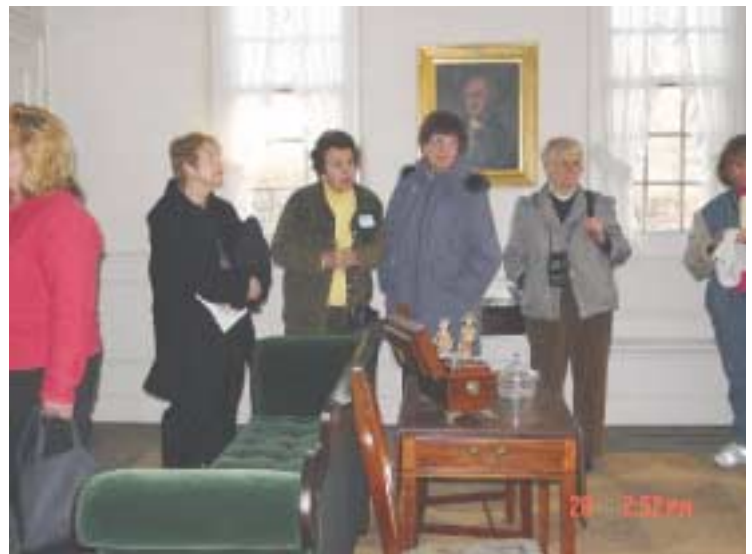
A tour through Hope Lodge