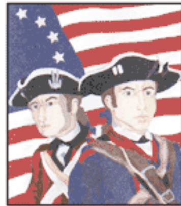
Patriots or Traitors?